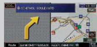
Arrow / map screen