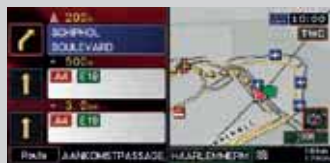
Turn list / map screen