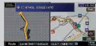
Detailed turn / map screen