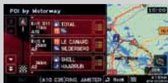
Points of Interest along the route