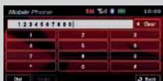
Mobile phone (in case factory Bluetooth kit installed)